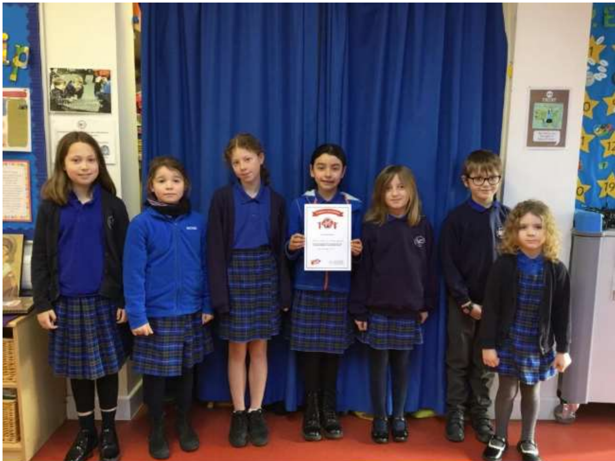
North Cerney pupils are really good citizens

https://www.wiltsglosstandard.co.uk/news/24160530.north-cerney-school-work-tackling-global-poverty-recognised-award/