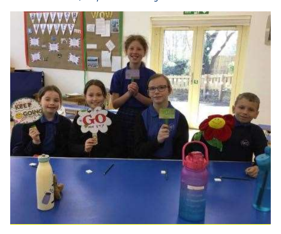
Owl class practising for the nature quiz!

Well done to our nature quiz team. They have been working so hard and won rounds against Chedworth and Stratton School, they are now through to the next round.